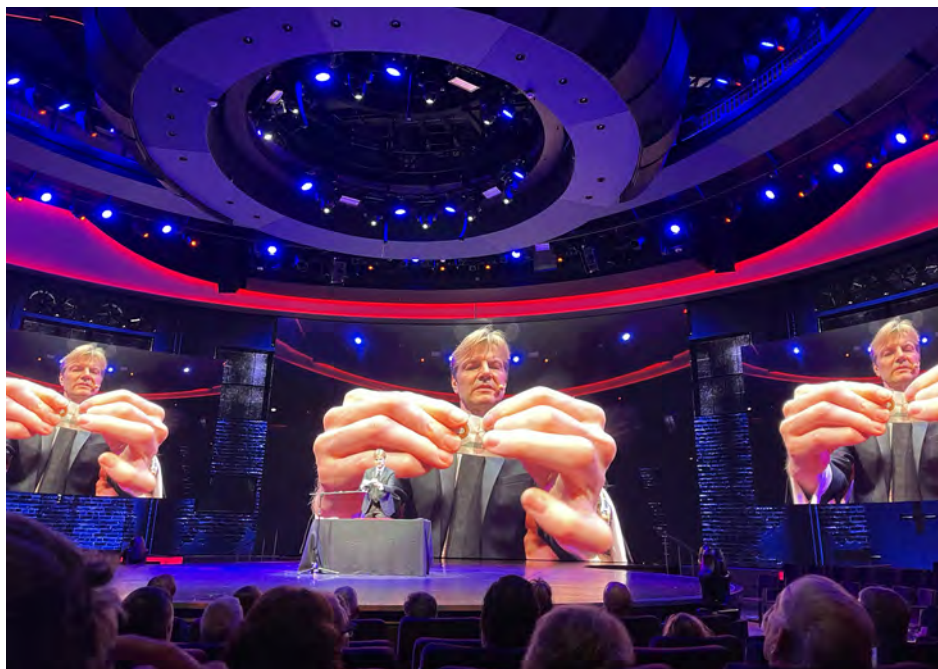
The Celebrity Apex theater during the show.