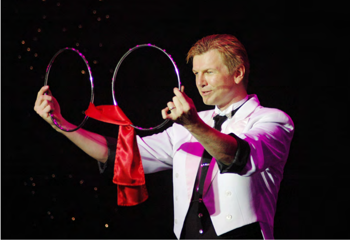
On stage with the Linking Rings, 2005.