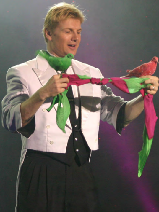
Dove production on Holland America's Zuiderdam, 2004.